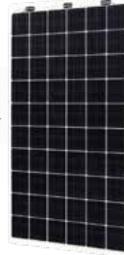
FRAMELESS PANEL 12% TRANSPARENCY